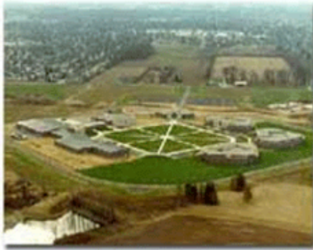
ODYS Secure Facility, Marion, OH

Department of Youth Services Secure Facility Marion, OH